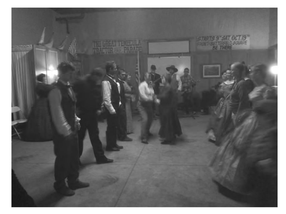
An old fashioned Barn Dance was enjoyed by a nice sized group on Saturday evening during VaRRA's Civil War event weekend acknowledging the Showalter Affair.

Newsletter from the Vail Ranch Restoration Association Copyright 2010, Temecula, California